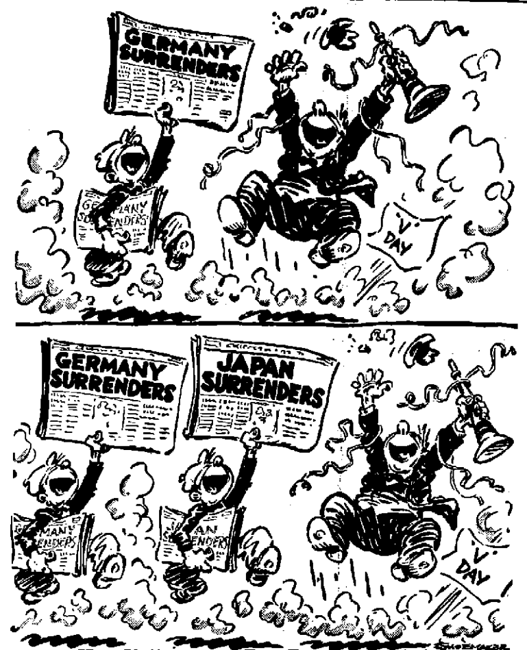
Let's Postpone the Celebration